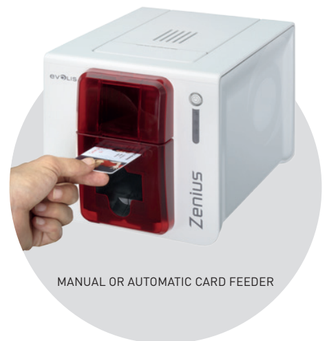
MANUAL OR AUTOMATIC CARD FEEDER

Easy handling, automatic ribbon recognition and setup